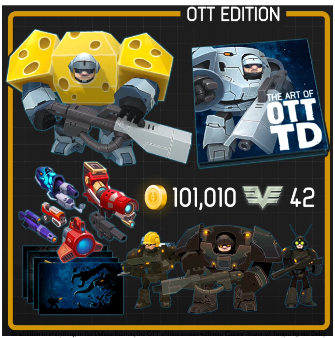
Division, which helps your soldiers get more XP and coins on the battlefield.